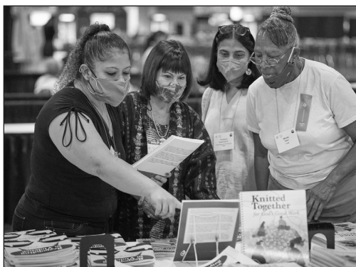
Members browse United Women in Faith program resources at the 2022 Assembly.